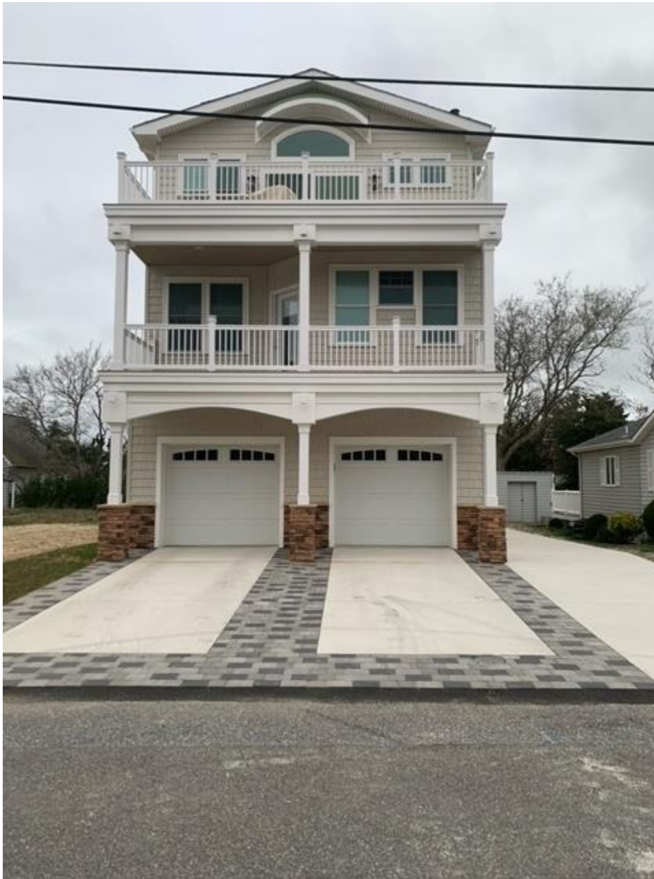
Developed lot across street (40' wide).

APPLICANT : Lisa Englebert 4 Brookdale Applicant's Photographs April 15, 2021 Page 4 of 5