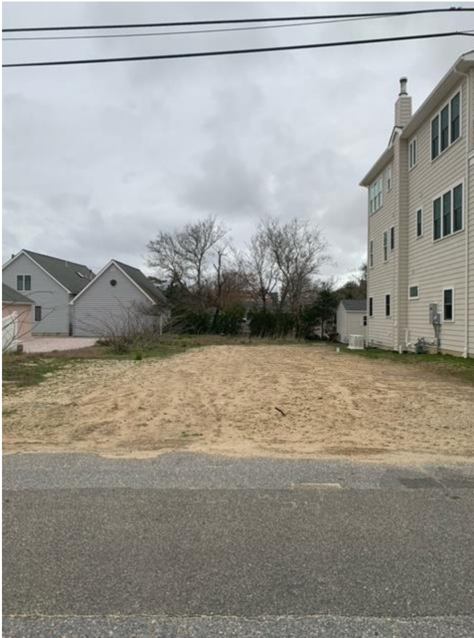
Vacant lot across street (40' wide)

APPLICANT : Lisa Englebert 4 Brookdale Applicant's Photographs April 15, 2021 Page 3 of 5